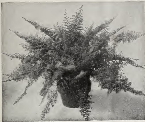
Beautiful "New Castle" Fern